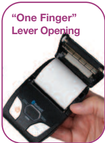
“One Finger” Lever Opening